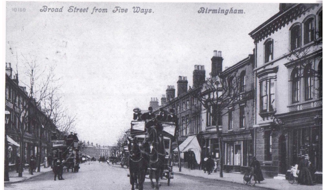
Broad Street Birmingham City Centre