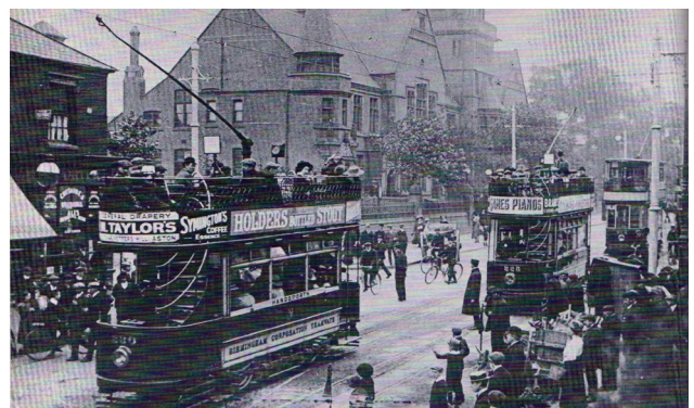
Travelling by tram